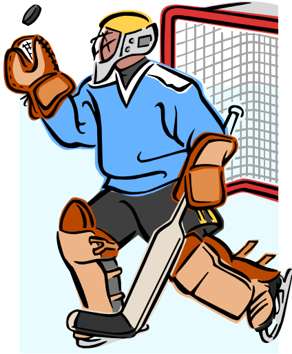
He is playing hockey.