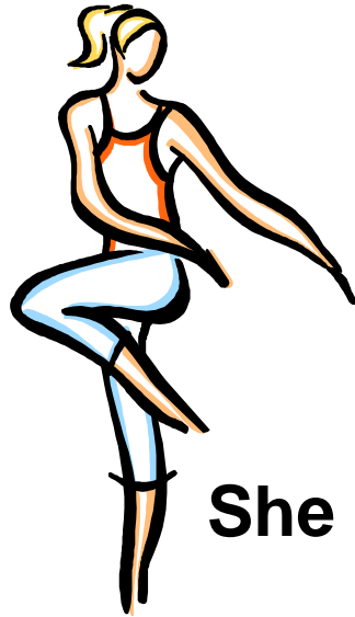
She is dancing.