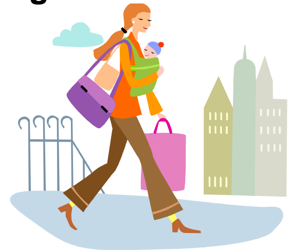
She is walking.