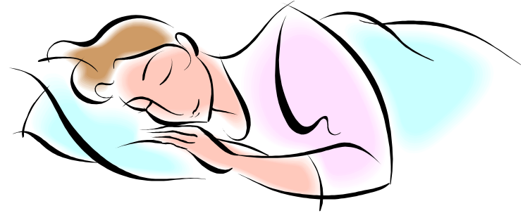
She is sleeping.