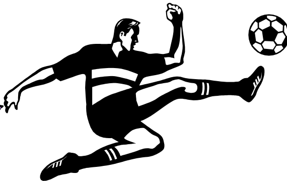
He is playing football.